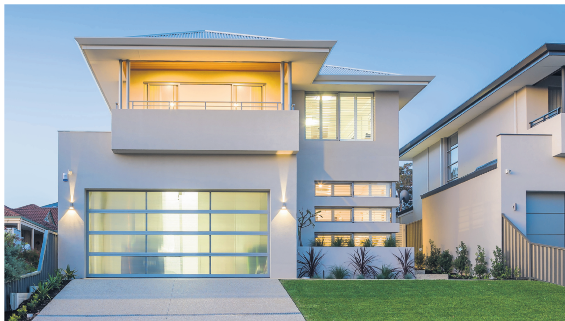
Steadman Homes' first show home is open in Melville.

"This is also the case with our specifications. Clients can start with our deluxe spec,